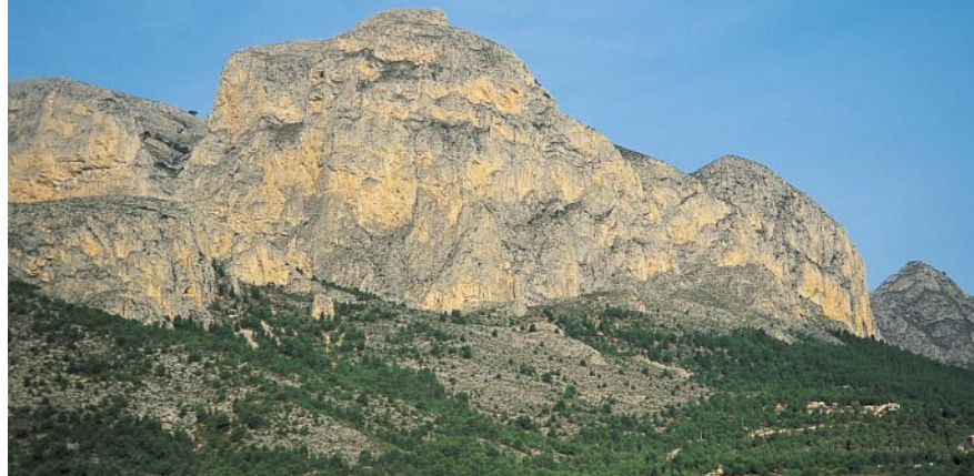
The 'sleeping lion' of Monte Ponoch as seen from La Nucía.

Alternatives: 1. From the Refugio descend right (see map p.67), turn right up road to car (3 hrs. in total). 2. Summit ascent from La Nucía, 320m: to La Nucía on CV-70, before town turn off left to Guadalest, at second roundabout go left onto narrow camí , past La Alberca estate, park at end of road by old wooden sign. Walk down across a barranco , then up right and in ½ hr. reach a large ruin; continue to Camí del Margoig, turn right, past a barrier, later turn left below a finca (waymarker further on right) and ascend path to Collado del Pouet (about 3 hrs. to summit).