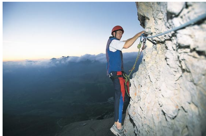
On the start of the climb of the Tête aux Chamois via ferrata.

News has quickly spread of a via ferrata running across the steep rock face just before the midway station and most passengers can be seen pressing their noses against the large panoramic windows in search of the tiny worms wriggling up the huge rock wall. Many a via ferratist's heart has sunk into his/her boots in the cable car crush before being spat out again at the midway station to go and brave the exceedingly airy and demanding diagonal route below the Tête aux Chamois.