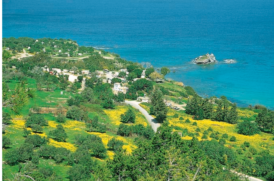
Chrysanthemum blossoms at the Baths of Aphrodite.

Linking tip: you can walk along the coastal path via Fontana Amorosa as far as the Cape of Arnaoutis (Walk 3).