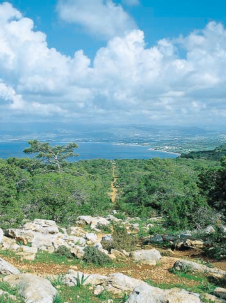
The sometimes stony path runs through macchia on its way from the Gulf of Chrysochou to Pyrgos tis Rigainas.

slightly to the left along the main path uphill. Some of the characteristic wild shrubs and plants of Cyprus can be found growing close together along the path: olive trees, carob trees, various types of gorse and the mastic tree. A wooden arrow points right to a path that winds its way up the hillside of Moutti, then runs for a short distance parallel to a farm track and eventually joins this path. Continue following the farm track uphill. 4 minutes later the narrower path leads off to the right again (waymarker), but keep following the wide path left uphill which ends at a turning circle after a few paces.