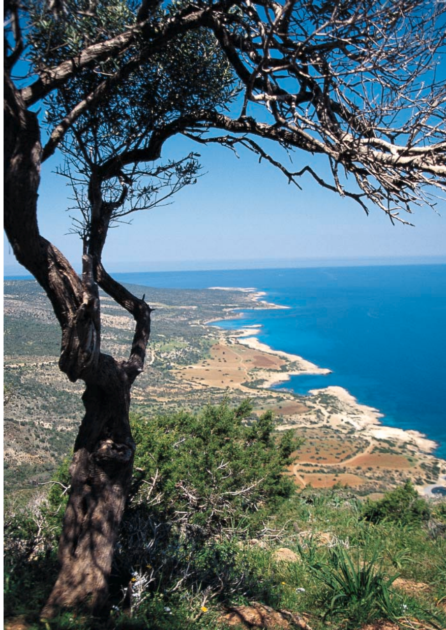
Panorama from Moutti tis Sotiras of the Akamas peninsula.

The mule path, slightly exposed, zigzags down to the coast and after the descent continues and after the descent continues, a few metres above the coastal path, running parallel to it. Ignore the left hand turn-off to the coastal path and stay at first on the nicer path until, after 10 minutes, this eventually joins the coastal path . Follow this path back to the Baths of Aphrodite . Go straight on at the point where you briefly met the coastal path coming from the baths at the start of the walk and, leaving the mobile homes on your left hand side, arrive back at the car park at the kiosk.