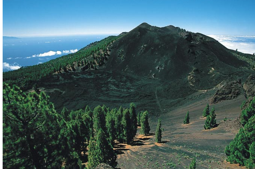
La Malforada lava field with Montaña del Fraile.

The next volcanic basin of La Malforada with the pitch-black lava field is visible further along the volcano route. The path continues to the right along the crater and forks at the lowest point of the crater rim at the foot of the Montaña del Fraile, (¼ hr.). Straight on a path goes off to the main summit of Deseada, 1945m (the path along the way touches the edge of the Cráter del Duraznero, finally left) – however, stay to the right along the main path. First it leads gently downwards in a wide curve around Duraznero and goes through an increasingly steep valley up to the summit of Deseada II , 1932m (½ hr.). A splendid panorama is the reward, and besides the caldera outline and distant parts of the volcano route, it