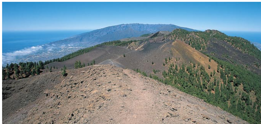
View from Deseada to the caldera.

From the road go straight through the picnic area to the Refugio del Pilar and 50m after the Visitors Centre (interesting exhibition about Cumbre Vieja) keep right at the fork in the direction of 'Los Canarios' (GR 131, red and white). After 10 minutes keep right again at the fork. The footpath runs at first through marvellous pine trees and the view opens out later of the mountains surrounding the Caldera de Taburiente and of the Aridane valley. Now cross the gritty volcanic hillside of Pico Birigoyo – only ferns, gorse bushes and pines brighten the landscape which is dominated by black sand. After a total of 40 minutes the path joins a forest road which is followed uphill to the left. 15 minutes later – once again in an open pine forest – the GR 131 turns off to the right onto a path that leads through a wonderful landscape which nature has modelled almost in the style of a park: gorse