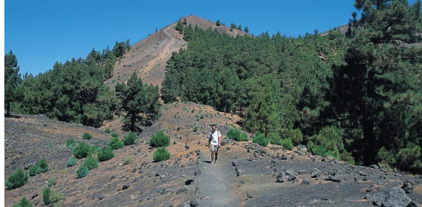
From Deseada it's downhill all the way.

does it level out a bit again. The camino is now bordered by stone walls and passes the first vineyards. After a few minutes of following the path straight on, another track is crossed (with the GR 130 ) and then another. The path now skirts another mountain to the right and ends after a few minutes in a track. This is followed to the left and abandoned after 5 minutes for a roadway which bears off diagonally left. Los Canarias can now be seen below. After a few minutes the road is crossed again keeping to the left and then the church is reached, followed 100m after that by the main road of Los Canarias (Fuencaliente).