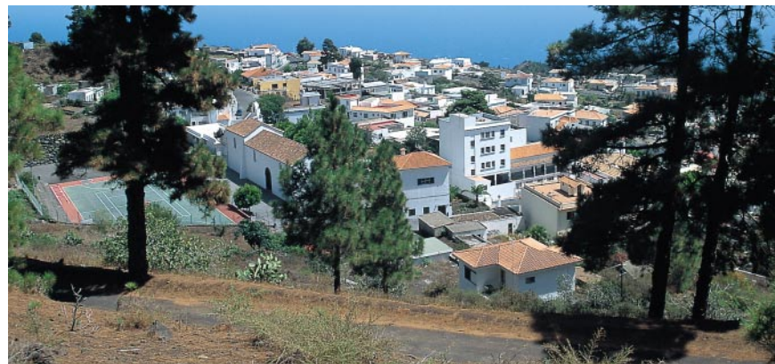
You can let the walk gently fade away in Los Canarias.

does it level out a bit again. The camino is now bordered by stone walls and passes the first vineyards. After a few minutes of following the path straight on, another track is crossed (with the GR 130 ) and then another. The path now skirts another mountain to the right and ends after a few minutes in a track. This is followed to the left and abandoned after 5 minutes for a roadway which bears off diagonally left. Los Canarias can now be seen below. After a few minutes the road is crossed again keeping to the left and then the church is reached, followed 100m after that by the main road of Los Canarias (Fuencaliente).