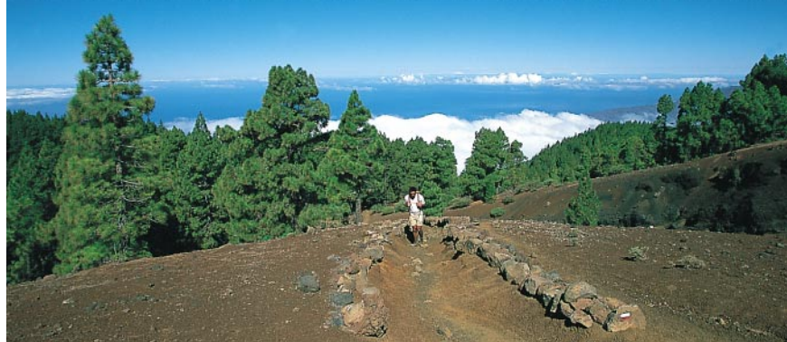
Ascent to the top of the Cumbre Vieja ridge.

From the road go straight through the picnic area to the Refugio del Pilar and 50m after the Visitors Centre (interesting exhibition about Cumbre Vieja) keep right at the fork in the direction of 'Los Canarios' (GR 131, red and white). After 10 minutes keep right again at the fork. The footpath runs at first through marvellous pine trees and the view opens out later of the mountains surrounding the Caldera de Taburiente and of the Aridane valley. Now cross the gritty volcanic hillside of Pico Birigoyo – only ferns, gorse bushes and pines brighten the landscape which is dominated by black sand. After a total of 40 minutes the path joins a forest road which is followed uphill to the left. 15 minutes later – once again in an open pine forest – the GR 131 turns off to the right onto a path that leads through a wonderful landscape which nature has modelled almost in the style of a park: gorse